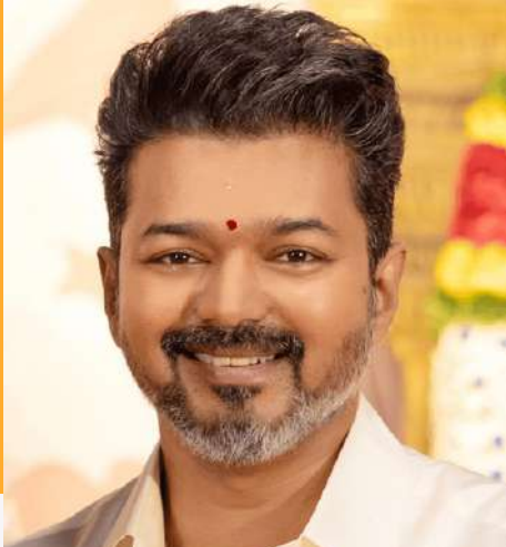
MR. C. JOSEPH VIJAY CHIEF MINISTER OF TAMIL NADU