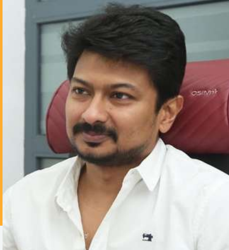
MR. UDHAYANIDHI STALIN LEADER OF THE OPPOSITION