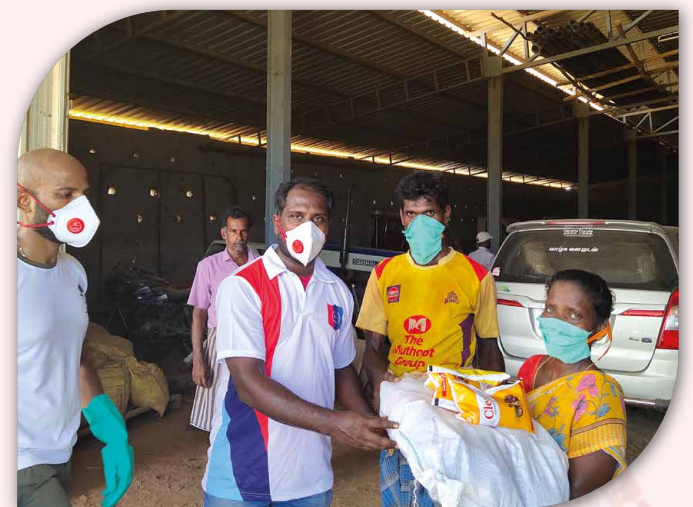
A migrant couple at Brick Kiln