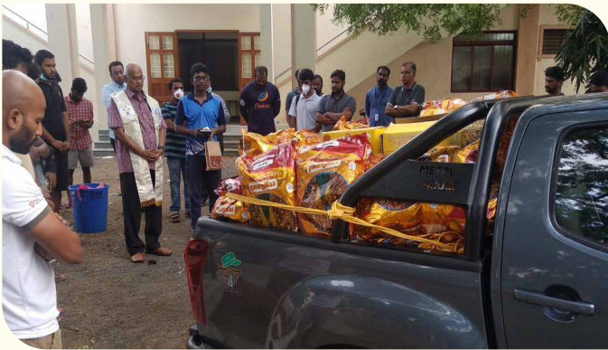
Blessing by Fr Rector