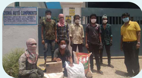
Stranded migrants with the provisions