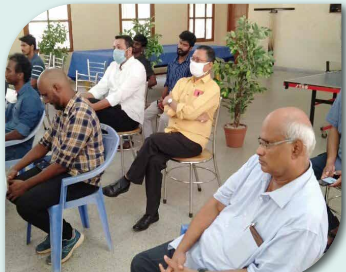
Loyola Alumni exhibit their generosity to work with their Alma Mater