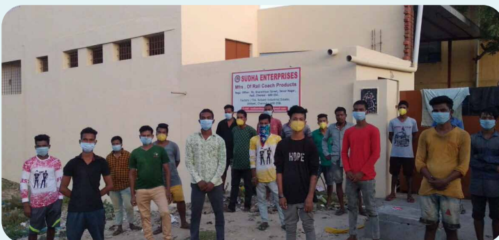
A group of young migrants at their work place