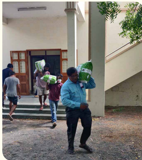
From leading to loading