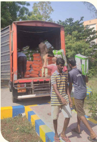
Srinivasa - Perambur vehicle with loaded materials