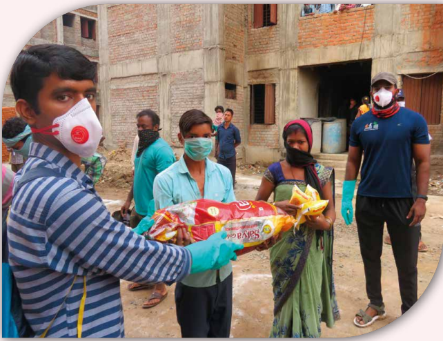
A migrant family with dry ration