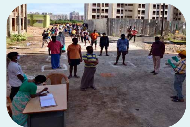
Name list, being verified at the construction site