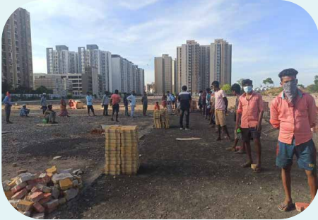
Migrants at the construction site