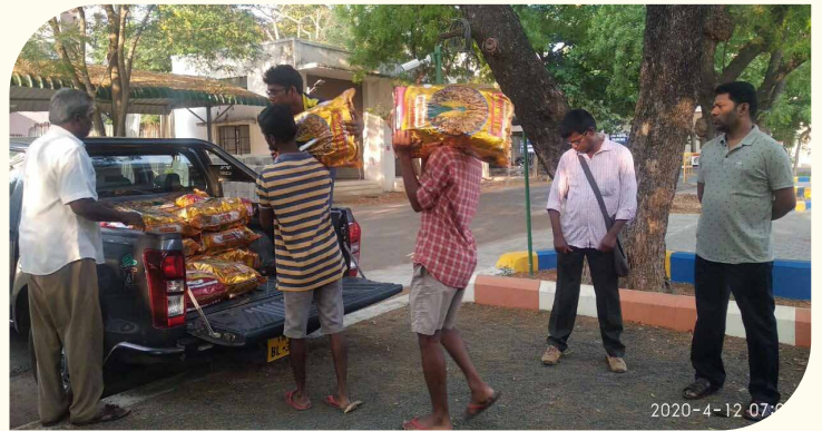
Loading by LOHO students