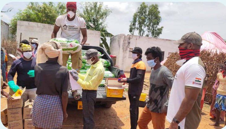
HHL - JMS at the Tamil migrants' settlement