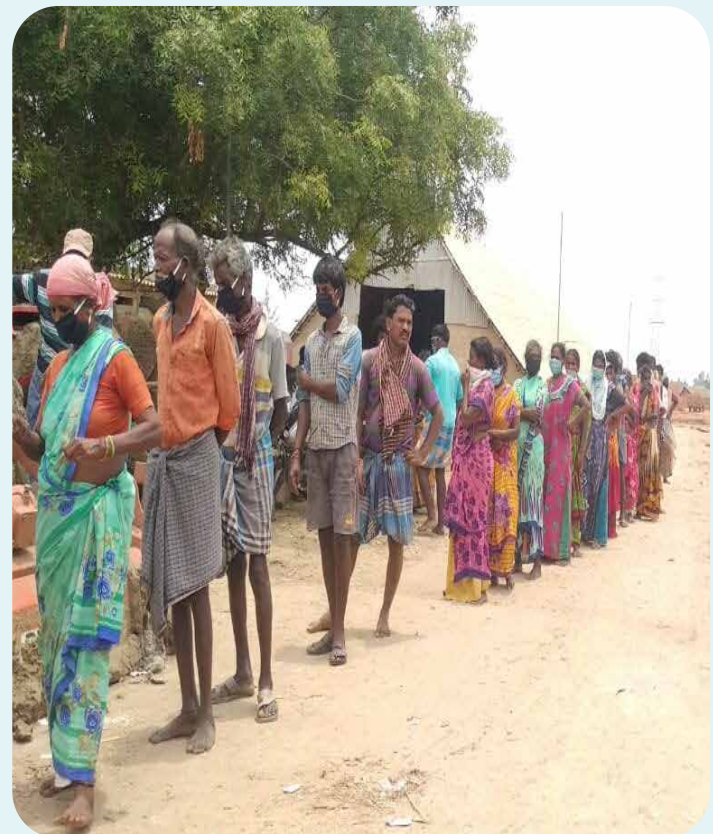
A long queue of Tamil migrants at Brick Kiln