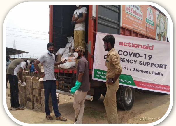
Our volunteers with the provisions of ActionAid

* Satya Nilayam, Berchmans Illam, Loyola Academy of Vadamelpakkam, Sisters of St Joseph of Lyons, St Dominic's School at St Thomas Mount, Jeyachandran Textiles - Chennai, Srinivasa Sweets - Perambur, Evangelical Church of Methodists and Trash Troopers provided financial and material support for the distribution.