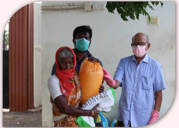
Distribution by Loyola Academy, Vadampakkam