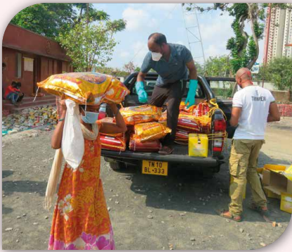
A migrant mother carrying the provisions