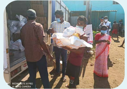
HHL - JMS at distribution