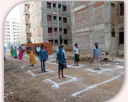
Social distance being maintained