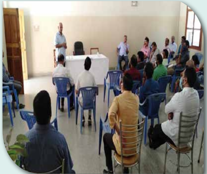
Loyola's decision to support the migrants