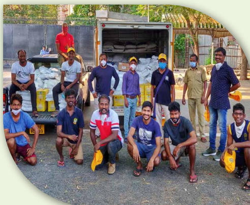
Team of volunteers