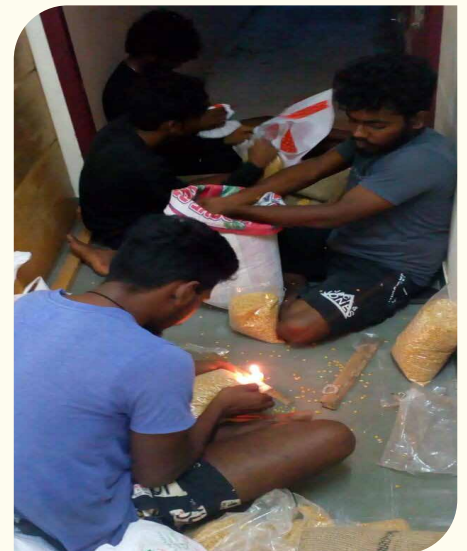
Packing of materials