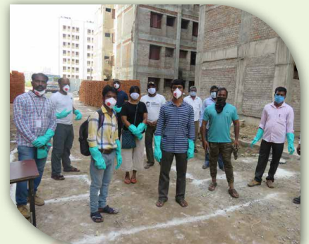
At the distribution spot