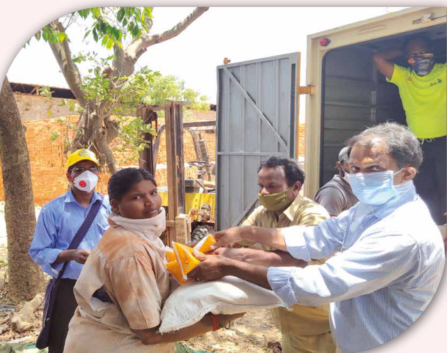
A Tamil migrant receiving dry ration