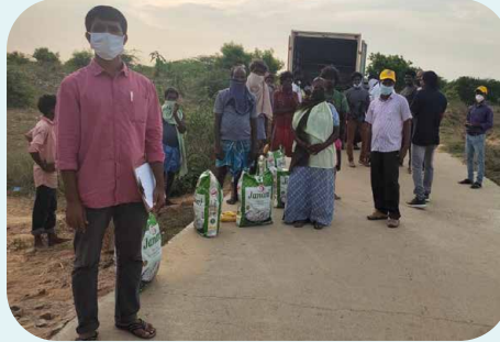
Tamil migrants at Kadambathur